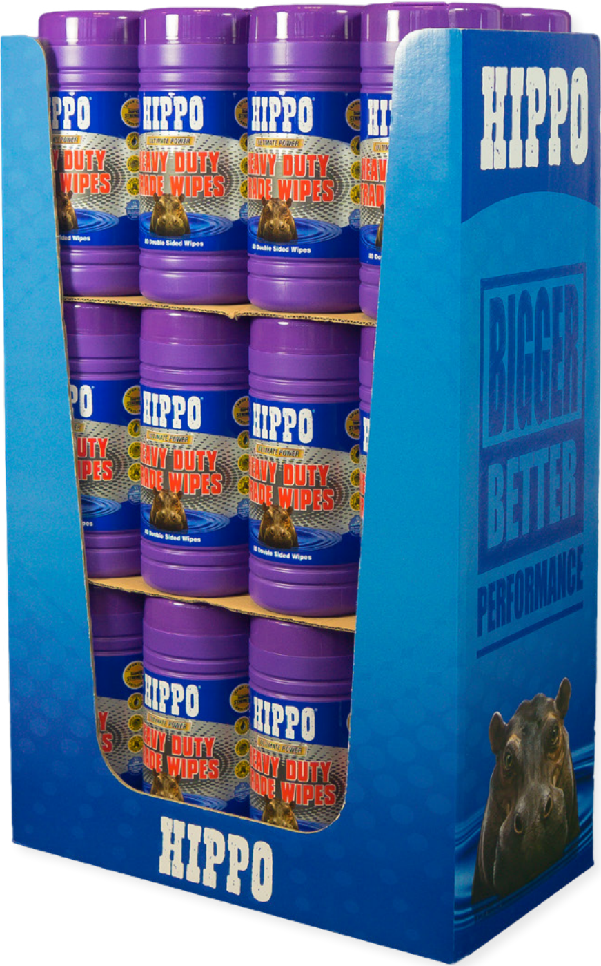
H18711-DISP ↗ Pre-loaded FSDU x24 Tubs