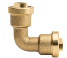
90 Degree Elbow