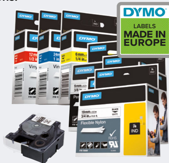
DYMO® Industrial Labels

All DYMO® IND Labels are made in Belgium, Europe.